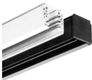
THREE-CIRCUIT RAIL TRACK design by