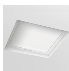
Multi use blank plate