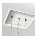
Blank plate for suspension