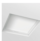
Multi use blank plate