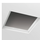
Regressed ceiling frame with flush edge